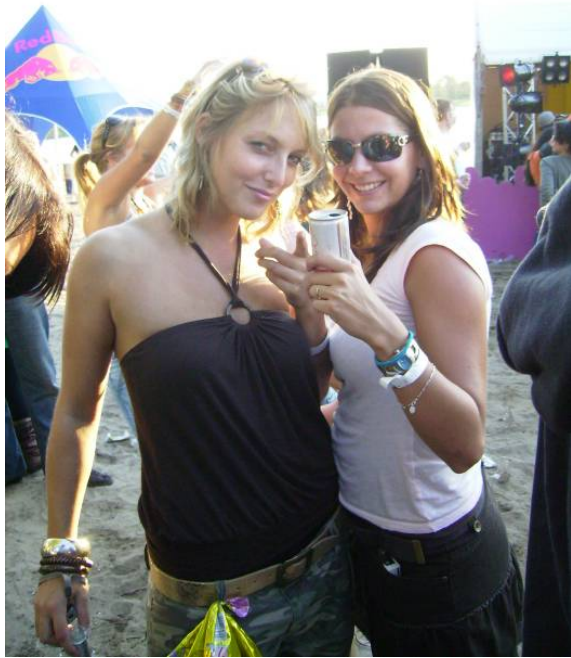
Visitors at Festival Lief enjoying a Bubbly Rosé