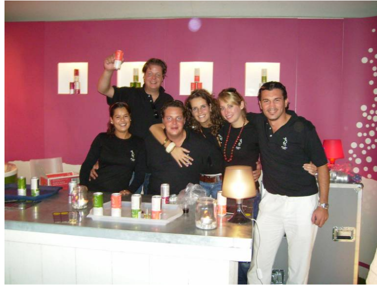
The Food Present promotional team at the Barokes stand at Festival Lief